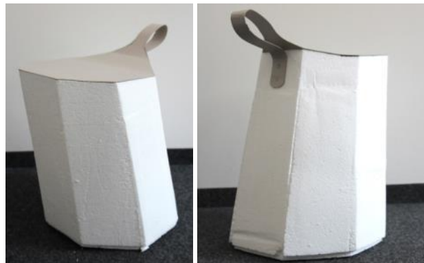
Model in real size for testing the rocking function