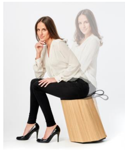
Almost one year lays between the first drawing and the final product

Another important goal is the high-end craftsmanship for the manufacturing of the entire Marlon Collection. Therefore we make it in Germany at highest standards. We want to use resources carefully and we want to make our furniture so it lasts. All woods that we use are certified by FSC; we source our fabrics, leather, and other accessories from within the EU.