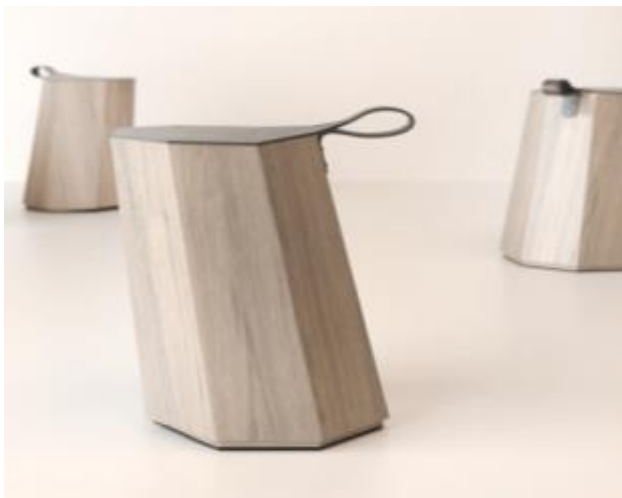
Looks real but is still only a rendering